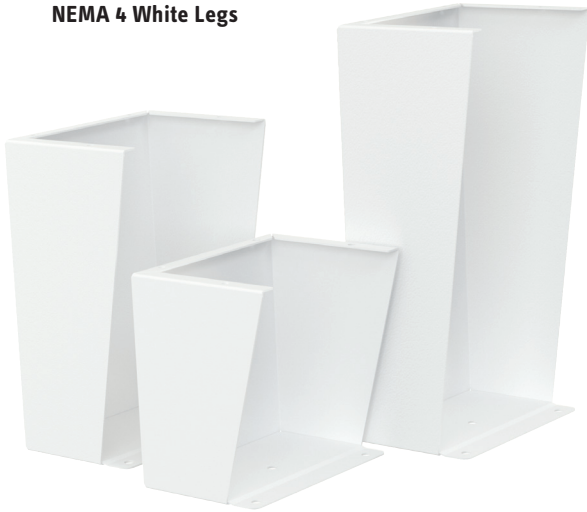
NEMA 4 White Legs