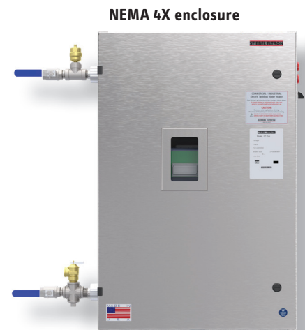
NEMA 4X enclosure