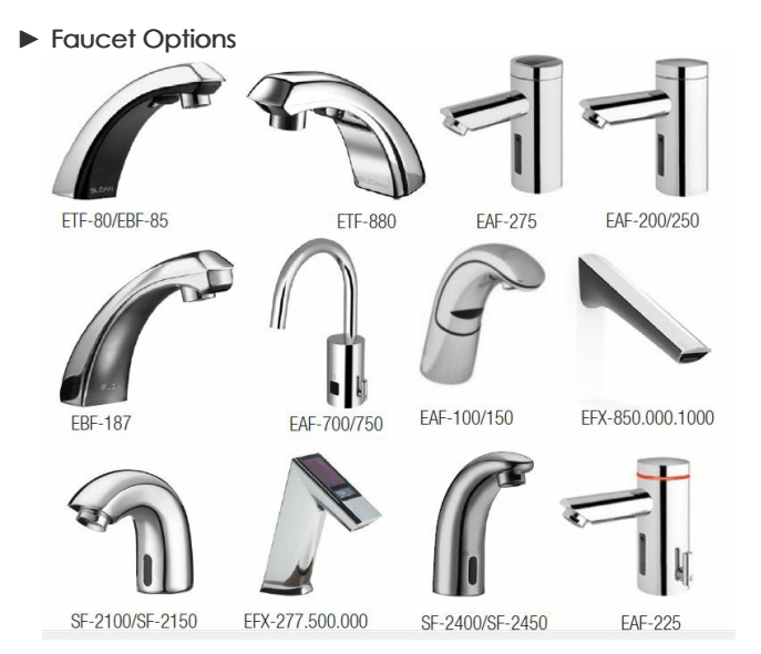
Not All Faucet Models Shown