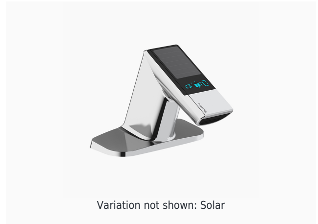
Variation not shown: Solar