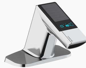
Variation not shown: Solar + LCD