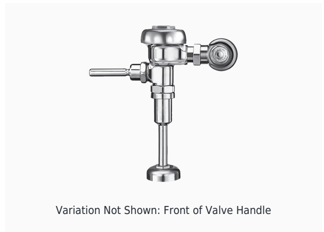
Variation Not Shown: Front of Valve Handle