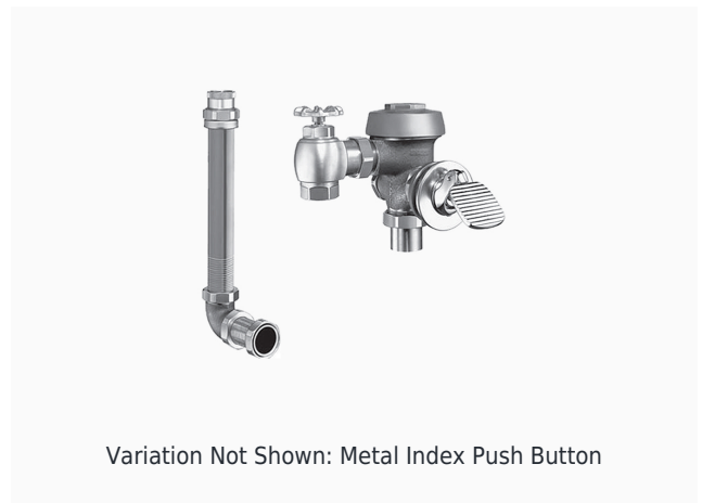
Variation Not Shown: Metal Index Push Button