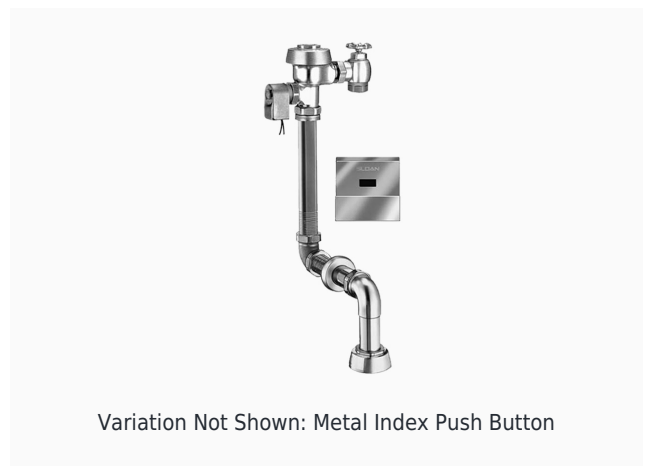
Variation Not Shown: Metal Index Push Button