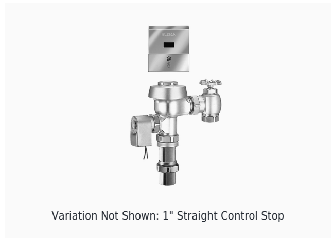
Variation Not Shown: 1" Straight Control Stop