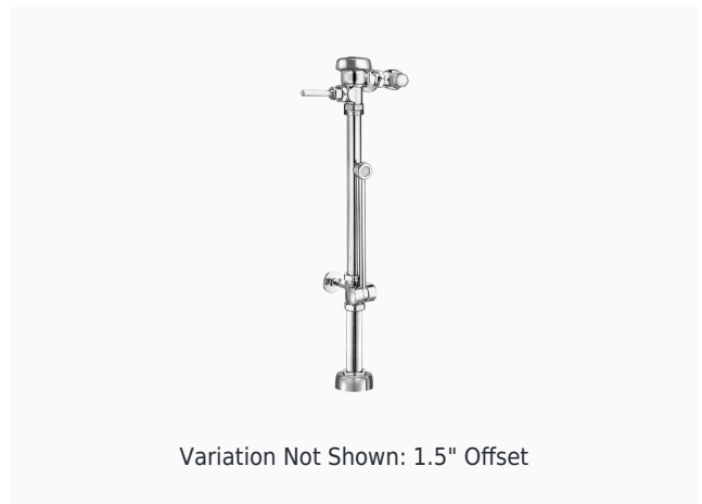
Variation Not Shown: 1.5" Offset