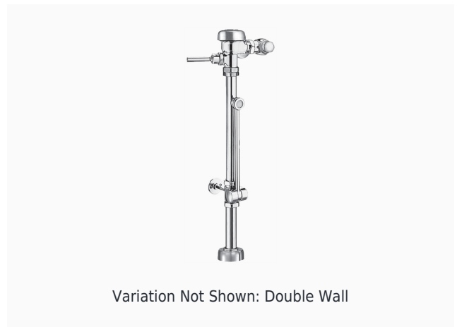
Variation Not Shown: Double Wall