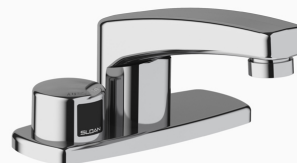
Variation not shown: 8" Trim Plate