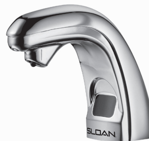
Variation not shown: Polished Brass