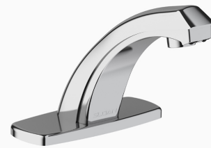
Variation not shown: Brushed Nickel