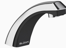
Variation not shown: 4" Trim Plate