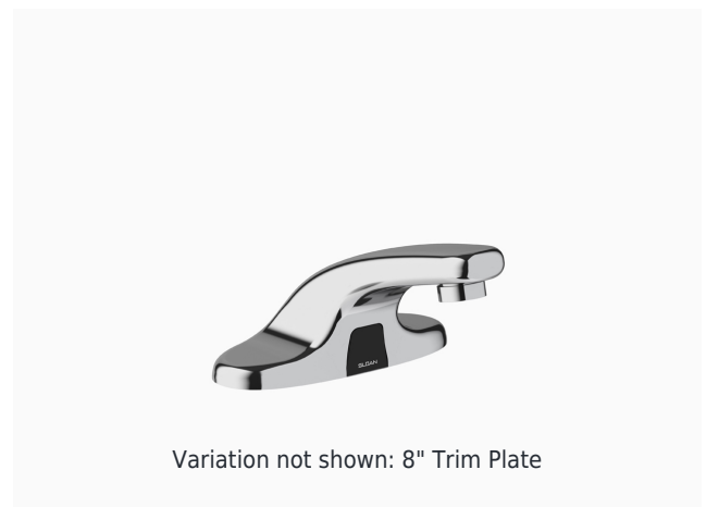
Variation not shown: 8" Trim Plate