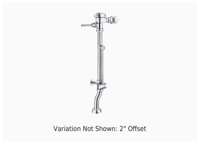
Variation Not Shown: 2" Offset