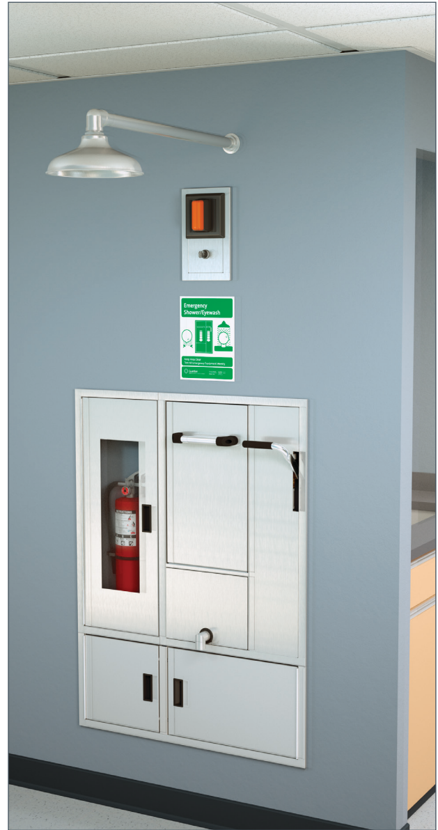
Note: Shown with optional AP280-237 electric light and alarm horn unit with silencing switch. (Fire extinguisher sold separately)

□ AP280-235 Electric strobe light and alarm horn unit for recess mounting in finished wall. Light illuminates and horn sounds when eye/face wash or shower is activated. Includes additional leads for remote monitoring.