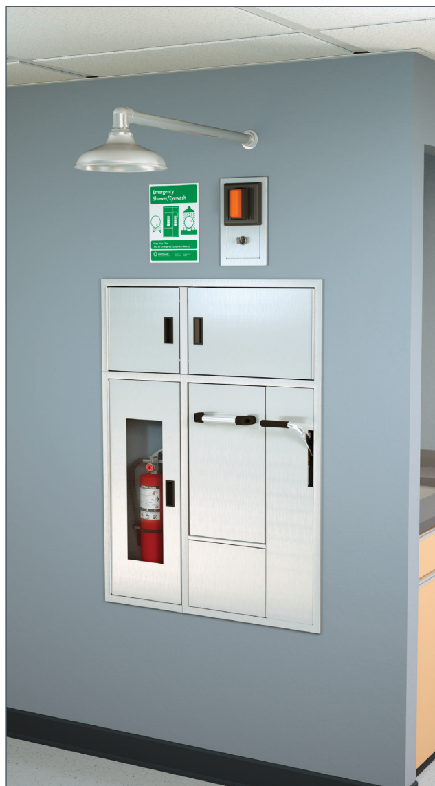
Note: Shown with optional AP280-237 electric light and alarm horn unit with silencing switch. (Fire extinguisher sold separately)

□ AP280-235 Electric strobe light and alarm horn unit for recess mounting in finished wall. Light illuminates and horn sounds when eye/face wash or shower is activated. Includes additional leads for remote monitoring.