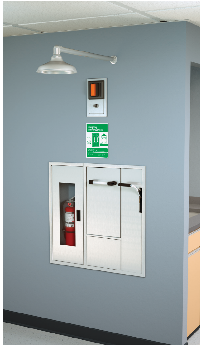
Note: Shown with optional AP280-237 electric light and alarm horn unit with silencing switch. (Fire extinguisher sold separately)

□ AP280-235 Electric strobe light and alarm horn unit for recess mounting in finished wall. Light illuminates and horn sounds when eye/face wash or shower is activated. Includes additional leads for remote monitoring.