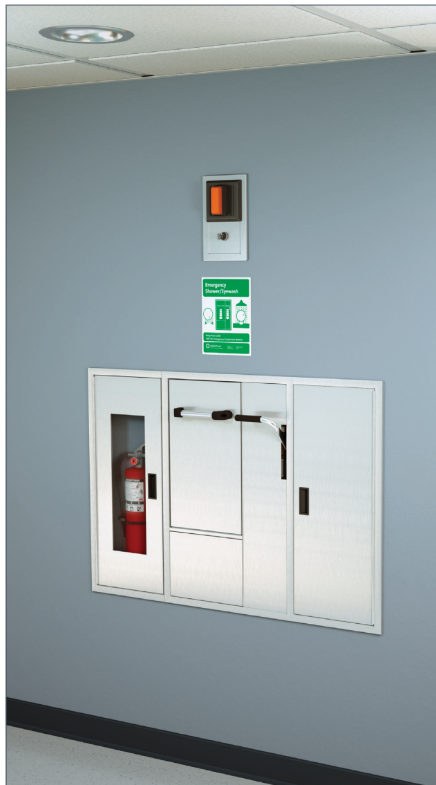
Note: Shown with optional AP280-237 electric light and alarm horn unit with silencing switch. (Fire extinguisher sold separately)

AP280-235 Electric strobe light and alarm horn unit for recess mounting in finished wall. Light illuminates and horn sounds when eye/face wash or shower is activated. Includes additional leads for remote monitoring.