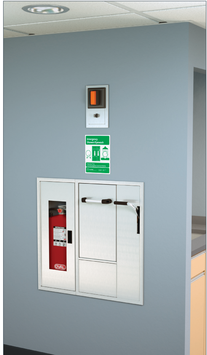
Note: Shown with optional AP280-237 electric light and alarm horn unit with silencing switch. Accommodates Oval fire extinguisher model 10JABC. (Fire extinguisher sold separately)

□ AP280-235 Electric strobe light and alarm horn unit for recess mounting in finished wall. Light illuminates and horn sounds when eye/face wash or shower is activated. Includes additional leads for remote monitoring.