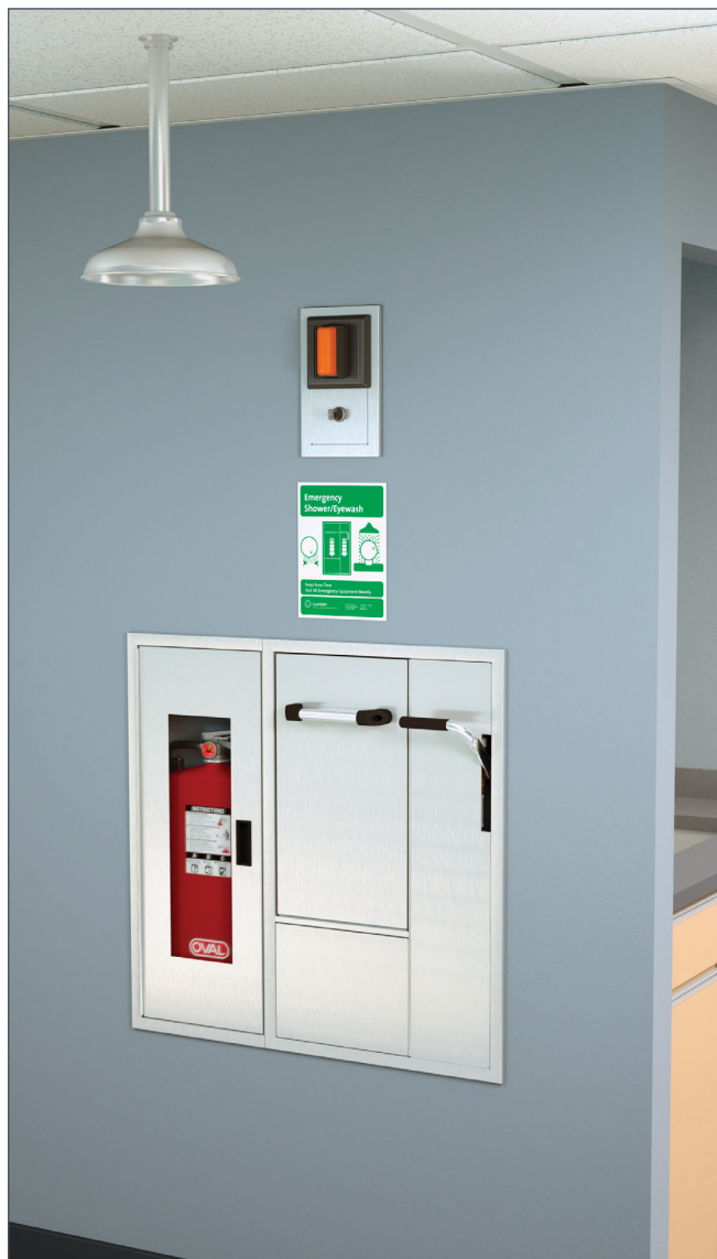
Note: Shown with optional AP280-237 electric light and alarm horn unit with silencing switch. Accommodates Oval fire extinguisher model 10JABC. (Fire extinguisher sold separately)

□ AP280-235 Electric strobe light and alarm horn unit for recess mounting in finished wall. Light illuminates and horn sounds when eye/face wash or shower is activated. Includes additional leads for remote monitoring.