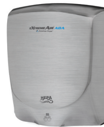
Stainless Steel Brushed