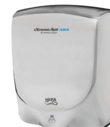
Stainless Steel Polished