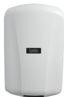
TA-ABS White Polymer (ABS)