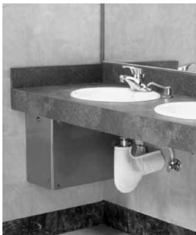
B-830 Cabinet for 12-liter Soap Tank Cartridge