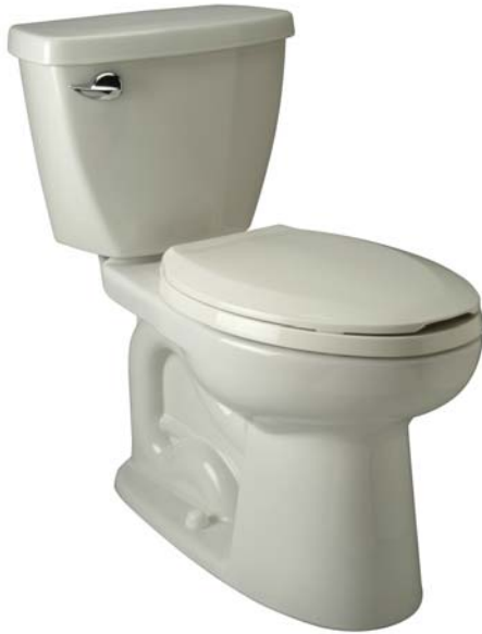
Model Z5555 shown above